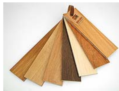
Tekno Fan Set