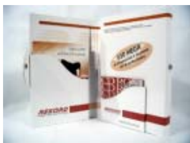
Architectural Folder w/CD ROM