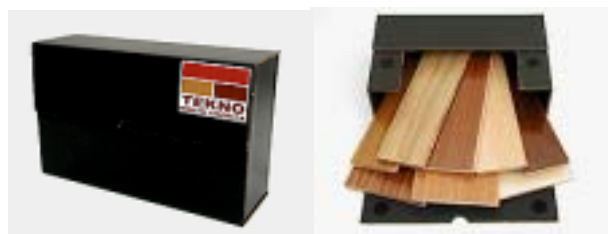
Tekno Black Box