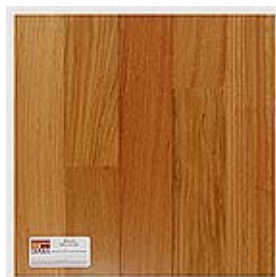
Tekno Display Panel - front