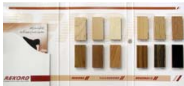
Architectural Folder w/CD ROM (inside view)