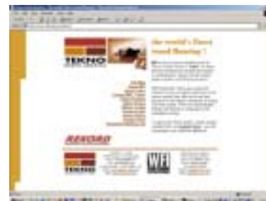
Tekno NA Web Site www.teknona.com