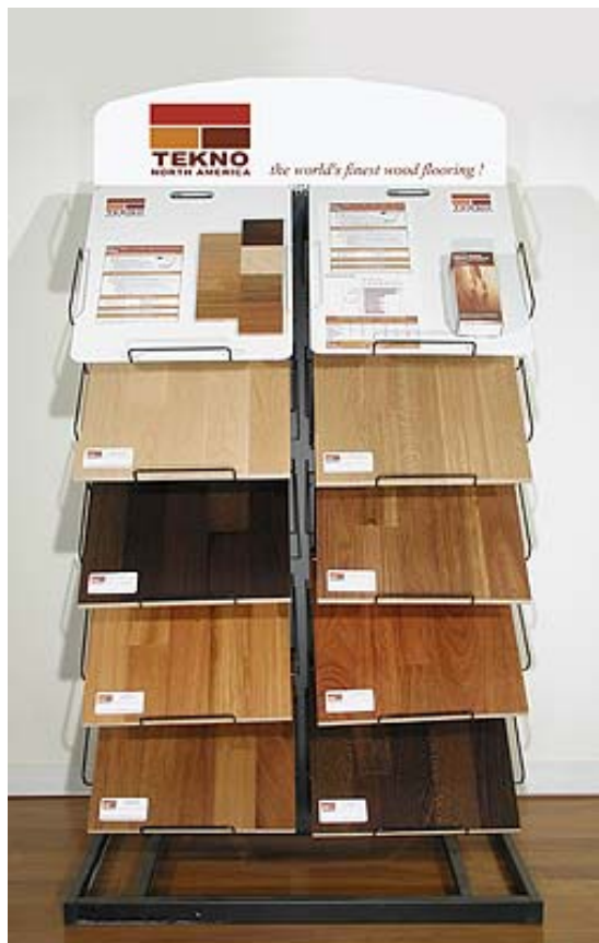
Tekno Point of Purchase (POP) Display Rack

WFI, in conjunction with Tekno, has developed an extensive range of marketing aids, sales tools and Point of Purchase Displays. WFI is pleased to offer the following: