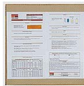
Tekno Display Panel - back