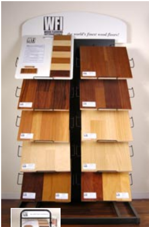
2 X 5 POP Rack