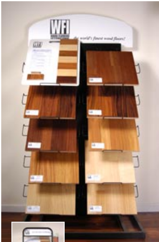
2 X 5 POP Rack