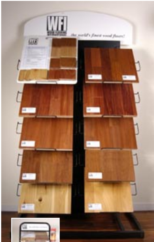
2 X 5 POP Rack