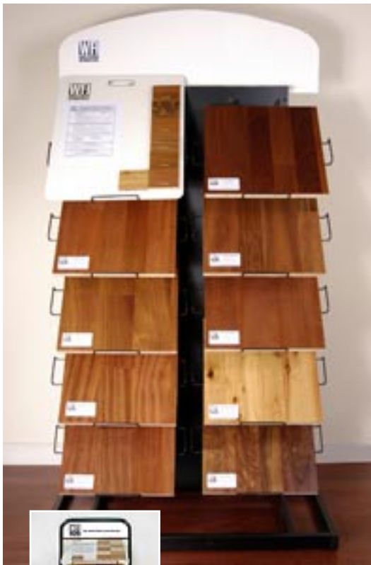
2 X 5 POP Rack