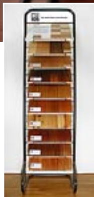
1 X 10 POP Rack is also available as a space-saving option.